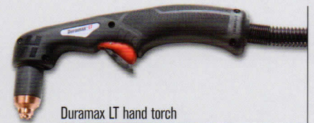
Duramax LT hand torch