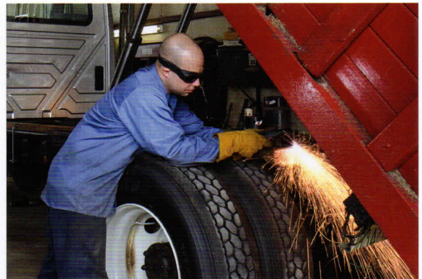
Vehicle repair and modification